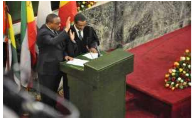
PM Hailemariam is sworn in

Earlier this month the House of People's Representatives re-endorsed Hailemariam Desalegn's nomination as prime minister, taking into account his zeal and effectiveness during his service in different regional and federal positions.