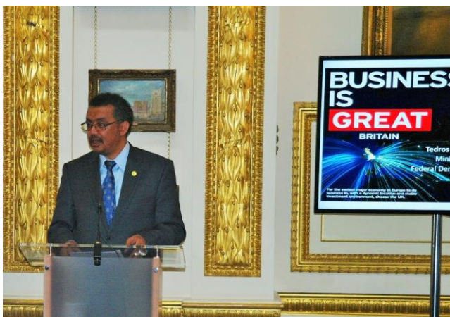
Dr Tedros Adhanom at the UK-China-Africa Forum

Ethiopia had never witnessed before the kind of rapid economic development that had occurred over the last decade - pro-poor, broad-based development drastically changing the livelihoods of the majority of the people. But Ethiopia is predominantly an agrarian country, and faces the challenge of improving agricultural productivity, expanding manufacturing and developing the capacity for value-addition. Ethiopia was committed to completely eradicating poverty by 2030, in line with the Sustainable Development Agenda. The number of people living in poverty had declined by 33% from 2000 to 2011, Ethiopia was making rapid progress on growth and poverty reduction with the largest social protection system in the developing world, while also keeping inequality levels very low. Happily the Forum working document underlined the necessity to ensure development is sustainable.