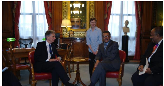
Dr Tedros and Phillip Hammond

During his visit he held bilateral discussions with Philip Hammond, the UK Secretary of State for Foreign and Commonwealth Affairs. The two ministers agreed to raise their level of political consultation to further strengthen the strategic partnership between Ethiopia and the UK.