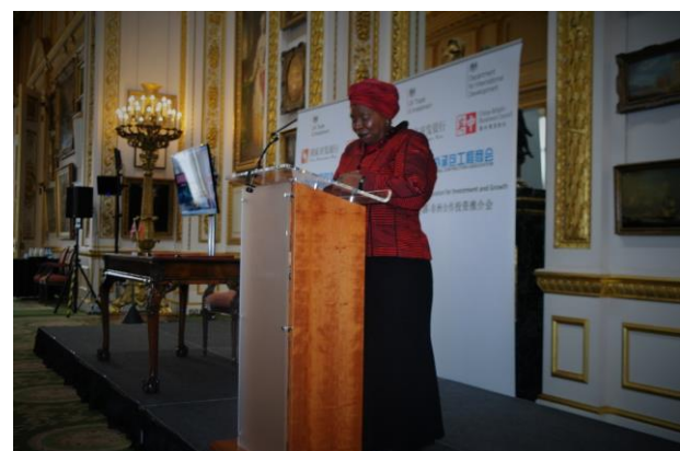
Dr Nkosazana Dlamini-Zuma, Chairperson of AU Commission

Ethiopia's Foreign Minister, Dr Tedros Adhanom, told the Forum that the occasion was particularly important for Ethiopia as it had a "close and productive partnership with both the UK and China." The Forum would be able to clarify the respective strengths of the UK and Chinese governments and "how the financial and business establishments of the two countries could best be combined to stimulate investment and inclusive growth in Africa."