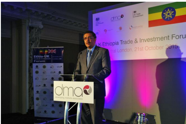
Dr Tedros at the UK-Ethiopia Trade and Investment Forum

In his speech, Dr Tedros described Great Britain as “one of the most dependable partners in Ethiopia’s fight against poverty.” The two countries shared many issues of common concern, not least “the desire to see a stable and secure environment in the Horn of Africa”.