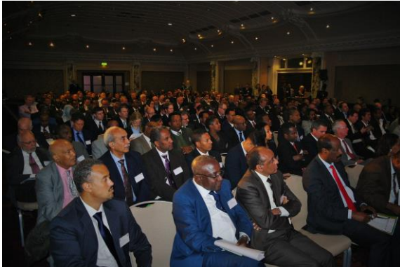
Hundreds of people attended the forum

The forum was attended by over 500 companies from the manufacturing, mining, agro-processing, finance and energy sectors. Alongside the event was the opportunity to hold business-to-business and government-to-business discussions. Members of the Ethiopian private sector were also part of talks with the London Chamber of Commerce.