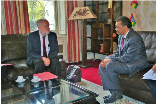
Dr Tedros meets Jeremy Corbyn, leader of the Labour Party

He stated that the UK-Ethiopia Trade and Investment Forum 2015 (held on 21 st October) witnessed yet another milestone in the country's burgeoning economic development, attracting a wealth of international investors.