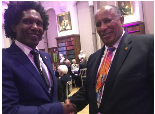
Lemn Sissay with the Ambassador