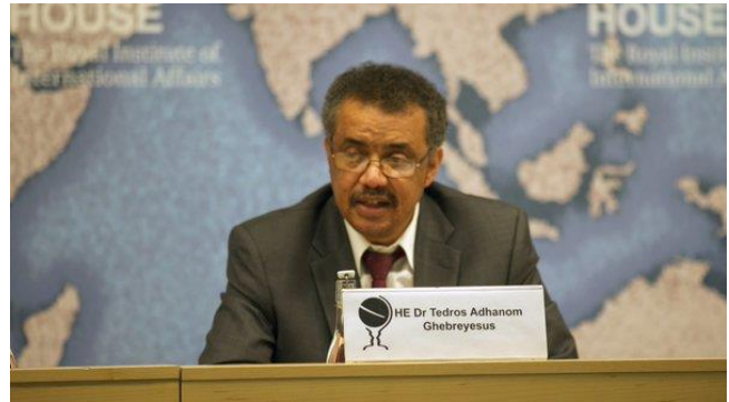
Dr Tedros speaking at Chatham House, London

by 2025. It also covered the country’s role as host of the African Union and chair of the regional bloc the Intergovernmental Authority on Development. Ethiopia is a key partner in peacekeeping missions across the continent.