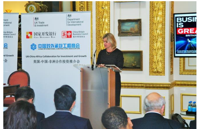
UK Secretary of State for International Development, Justine Greening

There was agreement on the importance and timeliness of the initiative. Participants strongly recommended that the issue be developed at inter-governmental level by the UK and China and concerned African countries.