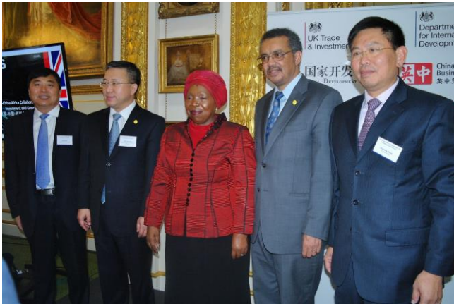
Dr Tedros, Dr Nkosazana Dlamini-Zuma and other delegates

Dr Tedros emphasized that Ethiopia strongly believed that economic transformation also depended upon international partnerships. That is why Ethiopia continued to strengthen these with traditional partners as well as with emerging economies such as China. Ethiopia, he said, is expanding industrial parks and economic zones and has the potential to become a global hub for manufacturing and agro-processing production. Its partnerships with the UK and China will enable sub-Saharan countries like Ethiopia to attract the necessary quality investment, offering the chance to access new markets in Europe and around the world. These partnership, he concluded, are also instrumental for mobilizing financial resources and building up the necessary human capacity.