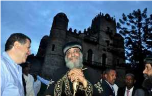
Pope Tawadros in Axum

Both the President, Dr Mulatu Teshome, and the Speaker of the House of Representatives, Abadula Gameda, held talks with his Holiness Abune Tawadros II, Pope of Alexandria and Patriarch of the See of St. Mark, at the end of September.