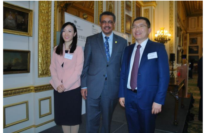
Dr Tedros flanked by representatives of the China Development Bank

crucial climate summit in Paris (30 th Nov-11 th Dec), Ethiopia was putting on the table an offer to reduce its emissions by 2030 , the first least developed country in the world to do so.