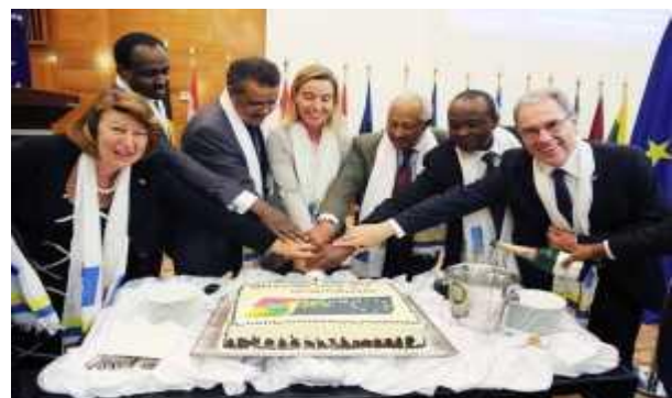
Dr Tedros with the EU delegation